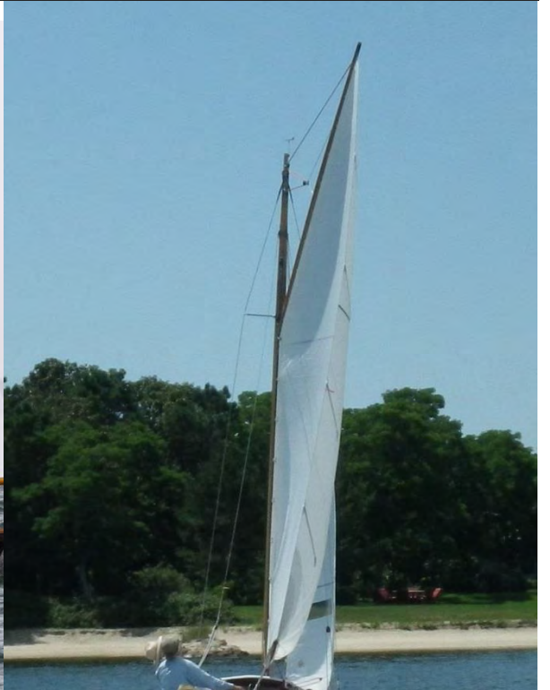
Billy Black: Centennial Weekend Photos