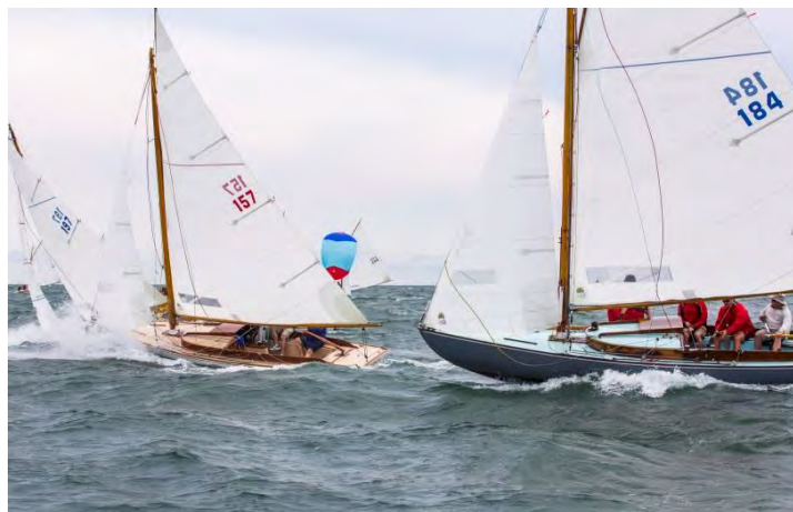
Billy Black Photo: Centennial Weekend